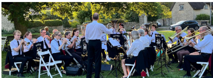
Left: Combe Feast , 11th August