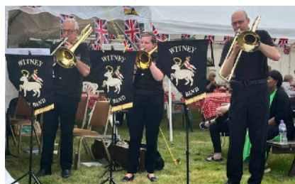
Right: Black Bourton Fete , 1st September