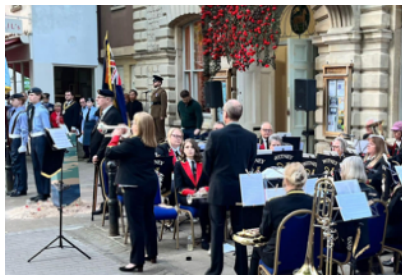
Above: D-Day 80th Anniversary Ceremony , 6th June

Over the last year, the band have been taking part, supporting and celebrating with the people of Witney and the wider community. Take a look at what we've been up to: