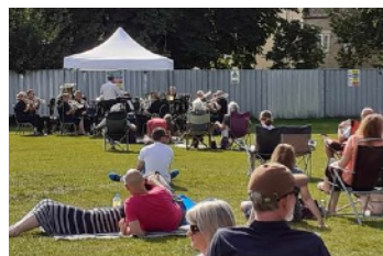
Left: Concert in the Park, Witney Leys , 3rd August