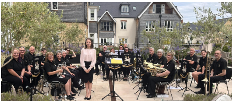
Right: Richmond Village , 27th July